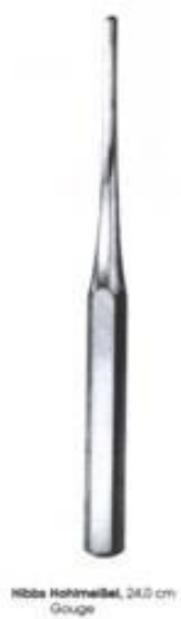
Hilbs Hohlmeißel, 24,0 cm Gouge