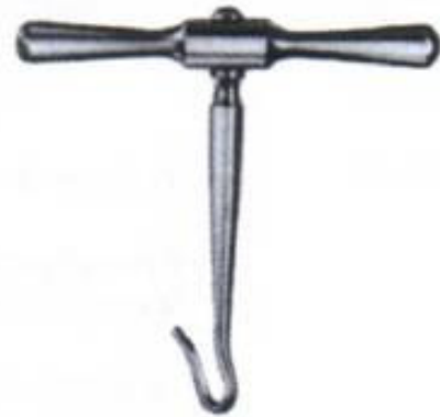
Griff für 31-130-.. Handle for 31-130-.. 31-135-00